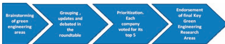
Figure 1. Process used to identify and agree on the key green engineering areas.